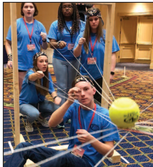
Students work together to solve problems during a team-building exercise at the 2019 Youth Leadership Workshop.

Students are selected for participation through various forms of intense competition conducted by their local electric cooperative. More than 1,000 young people were involved in the 2018-2019 program selection process.