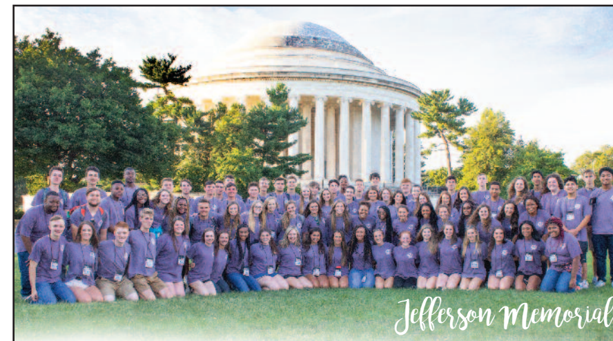
Sightseeing in Washington, D.C., included a stop at the Jefferson Memorial for these 2019 Youth Tour participants.

Each year Mississippi's student delegation joins more than 1,800 high school juniors from 43 states across the nation at the Youth Tour in Washington, D.C., where they learn about cooperatives and rural electrification from a national perspective.