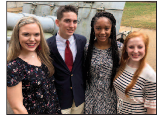
Students visit the Mississippi State Capitol and the United States Capitol.

At the 2019 workshop, students heard presentations from Gov. Phil Bryant and Lt. Gov. Tate Reeves, as well as motivational speakers, and discussed issues in a mock town hall meeting. By participating in a fun team-building exercise conducted by a team of professional instructors, students gained unique insight into the value of working with others to achieve common goals.